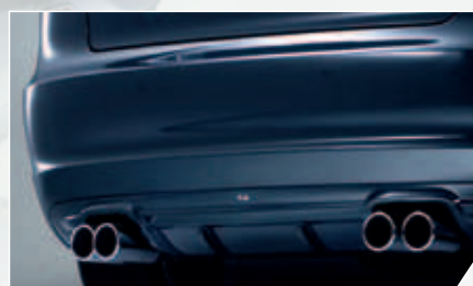
ABT rear skirt set. Including ABT 4-pipe rear muffler.

ABT DR sports wheel. Optimized weight, perfect concentricity, revolutionary design. The first ABT wheel with relieved rim base. And the only one with gun metal finish.