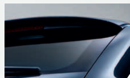
ABT rear wing. Dynamic and tasteful elegance.