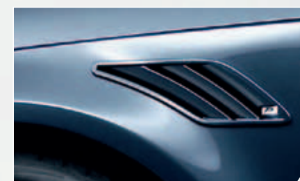
ABT fender inlets. Powerful optics down to the last detail.