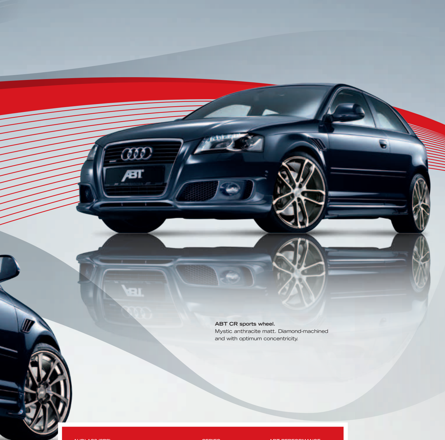
ABT CR sports wheel. Mystic anthracite matt. Diamond-machined and with optimum concentricity.