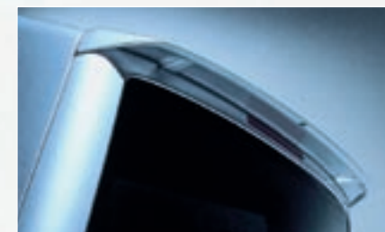
ABT rear wing. Dynamic and tasteful elegance.