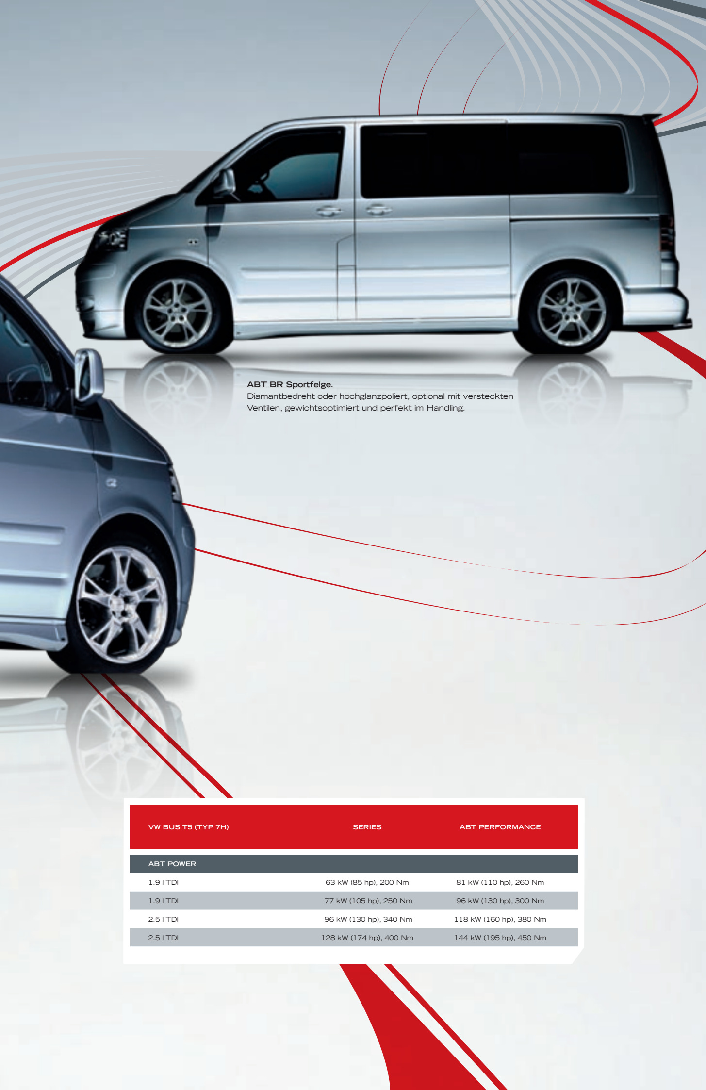
ABT BR Sportfelge. Diamantbedreht oder hochglanzpoliert, optional mit versteckten Ventilen, gewichtsoptimiert und perfekt im Handling.