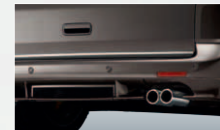
ABT rear skirt. With accompanying 4-pipe rear muffler – a clear signal to all following vehicles!