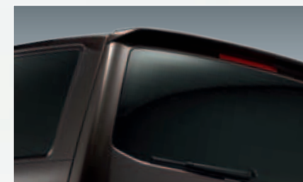
ABT rear spoiler. The spoiler discreetly but recognisably underlines the ABT performance aspiration.