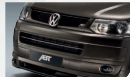
ABT front grille. The exclusive sports look instead of interchangeable VW visuals. Including ABT chrome emblem.

The increase in performance from 140 to 170 BHP, 400 Nm torque and the technically recommended lowering are great fun! The T5 gets its visual sportiness from its new front, its sidebars and a matching rear skirt with 4-pipe rear mufflers. The rear spoiler, finished in the vehicle's colour, and the tyres with their 19-inch DR sports wheels give a further kick. A powerful and extremely harmonious appearance!