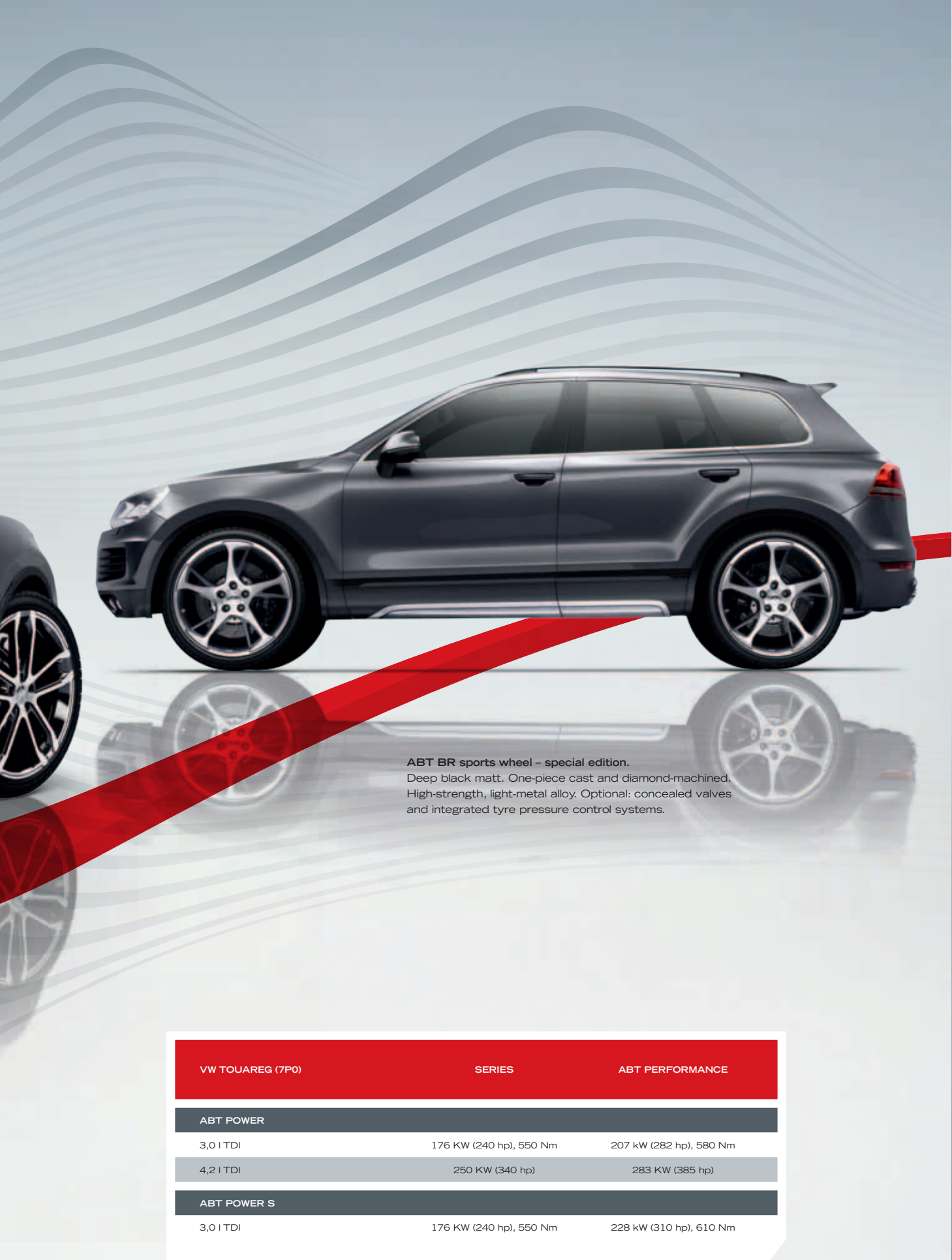
ABT BR sports wheel – special edition. Deep black matt. One-piece cast and diamond-machined. High-strength, light-metal alloy. Optional: concealed valves and integrated tyre pressure control systems.